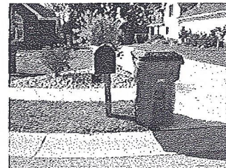
No Service Too Close to Mailbox

Waste Connections will continue to provide bulk pick up to residences in the City of Howe on the 1 st Saturday of each month. Items for bulk should be placed on the curb by 7 a.m. Bulky items include: mattresses, furniture, stoves, hot water heaters or similar items. No items with Freon will be accepted unless a certificate of removal from a certified HVAC technician is attached. Brush should be tied in bundles of no more than 45 lbs. and less than 4 ft. in length. We do not accept tires, batteries, chemicals, fertilizer, propane tanks, concrete, bricks, rocks or paint.