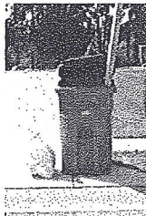
No Service Overloaded